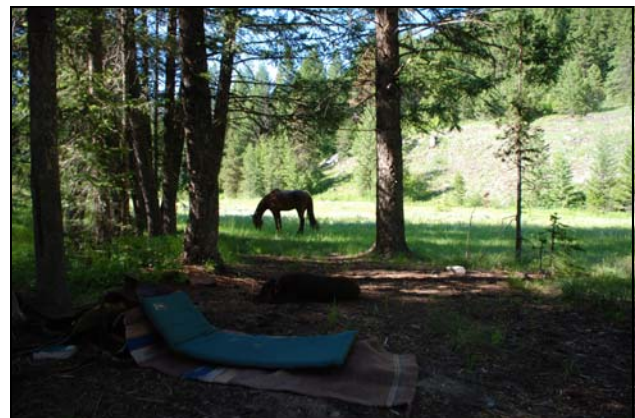
Camping out under the stars near Rattlesnake Creek