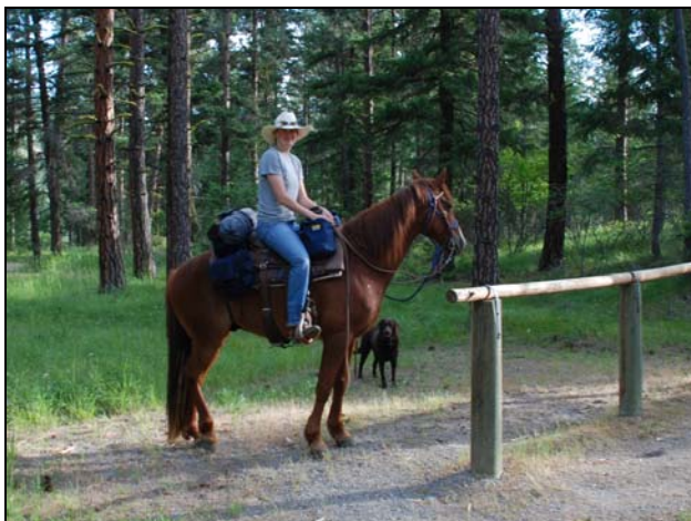
Ready to head out from the Rattlesnake horse trailhead near Missoula